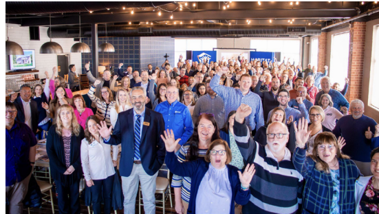
150 guests attended the 2026 Foundations Breakfast

What began just a few short years ago has quickly become one of the most impactful gatherings in Franklin County. This year's Foundations Breakfast once again brought together a full room of community leaders, partners, and supporters - all united by a shared belief: everyone deserves a safe, affordable place to call home. And together, that belief turned into action. At this year's sold-out event, attendees answered a simple but powerful question: Can this room raise $100,000? The response was overwhelming. By the end of the morning, the community had raised over $100,000 to support Habitat for Humanity of Franklin County's mission. It was more than a milestone - it was a testament to what is possible when people come together with purpose.