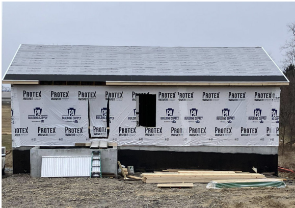
B&H Blitz Build on Richard Ave - A house in just 5 days!