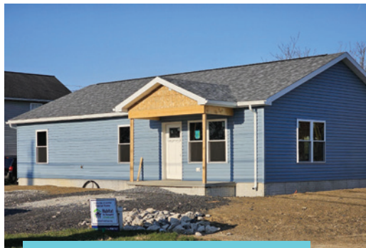
The Boxall house in Greencastle, PA. Photo was taken just before Easter.