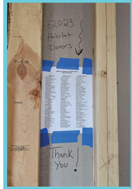
421 Donor names enclosed in the wall!

Tucked inside a bedroom wall at our Greencastle project is a list containing the names of every donor who contributed to HFHFC in 2023. This includes all memorial and honor gifts. Exactly 421 donors made a charitable donation to us last year. Donor names will be strategically and discreetly placed inside each new Habitat home we build, just like we did at Greencastle. This appropriately positions the donor names with volunteer hands. It takes both to build a house. At Habitat we pair and share the power of generous gifts with volunteer labor. Our volunteers often sign their names on the studs or write Scripture verses on the walls before finishing. We hope that you, our faithful donors, can feel a sense of connection with homes knowing that your donated dollars provide volunteer opportunities and shelter for the families who dwell within them. Tucked inside this newsletter is an envelope. Please consider making a springtime gift to HFHFC in support of our housing ministry. Let's get your name inside the next house!