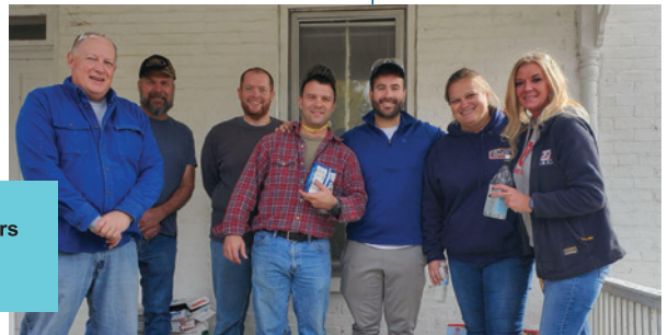
Chamber of Commerce (CVBA) volunteers at our Waynesboro rehab project.

If you have a building lot in Franklin County and would like to consider donating it to our mission, please contact our office. We are able to receipt donors for the market value of the land.